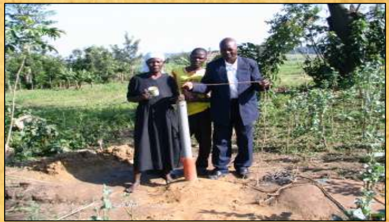
One of several new bailer bucket wells in Bungoma, Kenya.

Online: www.hydromissions.com Email: info@hydromissions.com Phone: 864-967-7865